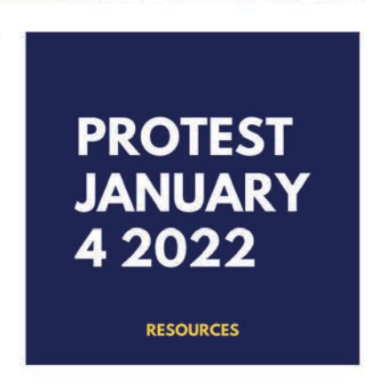
Figure 2: Homepage of the nobeijing2022[.]org website

Times as "the global boycott of the 2022 Beijing Winter Olympics loads shellcode from a macro1. The file name of the sample is website". The Epoch Times is a New York-based, multi-language "2022冬奥网络安全HW资料.doc", which translates from Chinese to (mainly Chinese and English) newspaper and media company "2022 Winter Olympics that opposes the CCP and is known for its far-right views. The Epoch Times promoted the boycottbeijing2022[.]net domain in response to the CCP's "persecution of human rights in Xinjiang, Tibet, Hong Kong and mainland China, as well as threats to Taiwan" in an unsuccessful effort to prevent the 2022 Winter Olympics from being held in Beijing. Another similar protest domain is nobeijing2022[.]org, which seems to be one of the most popular protest domains based on online discussions, is still active as of this writing, and shares statistics on China's "crackdowns against freedom, democracy, and human rights" and encourages people to organize and protest.