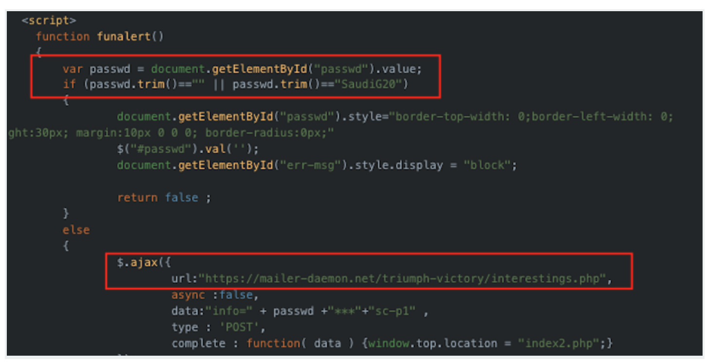
Figure 5 : Investigation of HTML revealed "SaudiG20" variable in a JavaScript function

Insikt Group identified the likely reuse of code in the HTML of the Sir Bani Yas spoofed registration page. A JavaScript function specifically lists a variable "passwd.trim()=="SaudiG20", which is likely not related to the Sir Bani Yas forum and is more likely associated with the G20 meeting hosted by Saudi Arabia in 2020.