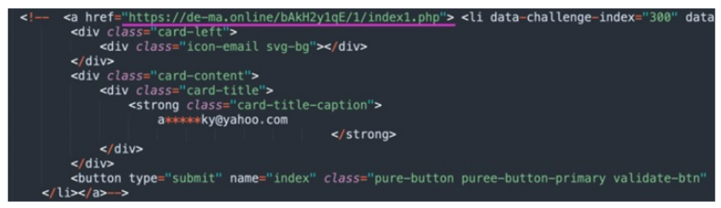
Figure 4: HTML code revealing links to de-ma[.]online domain

Check Point Researchers also <u>cited</u> that the HTML of the URL shortener (litby[.]us) revealed direct links to a cluster of threat activity <u>attributed</u> to the Phosphorus APT in 2020. The domain "de-ma[.]online" underlined in Figure 4 has not had an active DNS "A" record since November 2020.