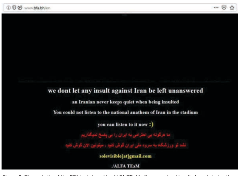
Figure 3: The website of the BFA is defaced by ALFA TEaM after perceived insults heard during the Iranian national anthem at a Bahraini stadium

In large part, attacks such as those committed against the Syrian Football Federation after a 2018 FIFA World Cup qualifying game, or against Bahrain's Football Association (BFA) after a 2022 World Cup qualifier, materialized as hacktivists perceiving a sense of injustice or in response to insults against the Iranian football team or nation. Given the current <u>tensions</u> between Japan and South Korea as well as the political disputes <u>related</u> to the Senkaku/Diaoyu Islands with China, a nationalistic hacktivist campaign out of China in particular targeting Japanese infrastructure is plausible but deemed unlikely given the recent decline in patriotic hacktivism in recent years.