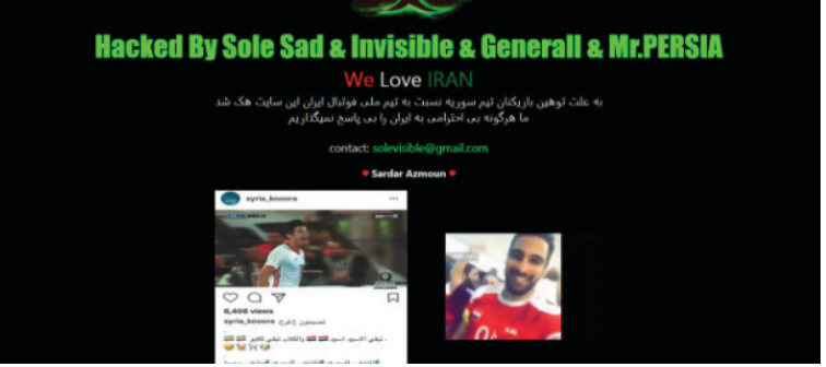
Figure 2: Defacement imagery posted by ALFA TEaM members against the Syrian Soccer Federation

Hacktivist groups rely on media attention to spread their message, and disruptive cyber activities during the event will receive immediate <u>press attention</u>, as observed during the 2018 PyeongChang Olympics. For example, various Iranian hacktivist groups have historically launched targeted website defacement attacks against international football teams, either in support of a local Iranian team competing in international competitions or in support of Iran's national football team. Such attacks have been committed by members responsible for the ALFA TEaM's AlfaShell and have targeted a host of international and regional football sporting organizations.